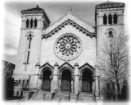
St. Clement Church Chicago, Illinois