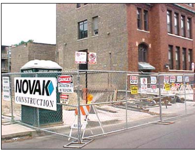
Construction of an addition to St. Clement School is possible because of parishioners' generosity and commitment to the Anchored in Faith capital campaign.

The Anchored in Faith capital campaign has been a great success. Parishioners' prompt and consistent pledge payments have allowed us to move forward