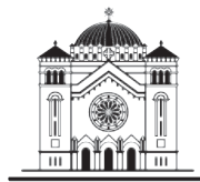
Photo credits: Thank you to our dedicated staff, volunteers, and parishioners for taking photos at our events and sharing them with us for our parish publications. Also, thank you to Amy Boyle of amyboylephotography.com for giving us permission to use the following images: front page rows 1a, 1b, 2a, 3a, 3b; page 2 row 1a, 1c; page 3 rows 1a, 2a; page 4 row 1b, 1c; and the staff photos.

Saint Clement School 2524 North Orchard Street Chicago, IL 60614 t: 773-348-8212 f: 773-348-4712 www.stclementschooll.org